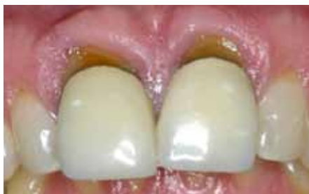
Fig. 5: Close-up view of the central incisors showing the excessively long clinical crowns.

The right central incisor was hopeless and needed to be extracted quickly. Three management protocols to avoid a resorbed ridge were available. First was socket regeneration. Second was to allow the ridge to heal after extraction, with later reconstruction of the resorbed ridge and later still implant placement. Third was immediate implant placement with augmentation. The choice comes at the time of extraction.