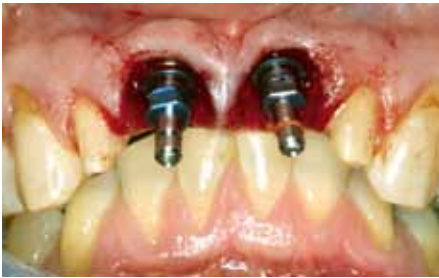
Fig. 9: 5.0x13.0mm J-Series SCREW-LINE implants have been placed to the palatal aspect of the sockets. The platforms were placed only slightly sub-gingivally.