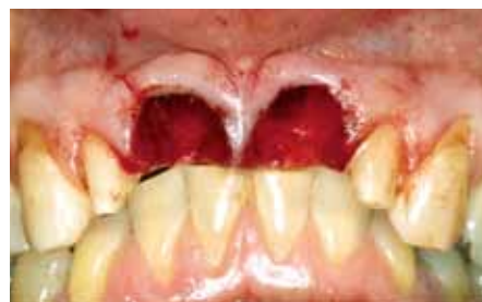
Fig. 8: The roots of the two central incisors have now been removed and the bone sockets curretted and inspected. The sockets are intact though very wide (8 mm).