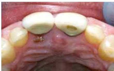
Fig. 2: Palatal view, which shows the evident fracture of the supporting tooth.