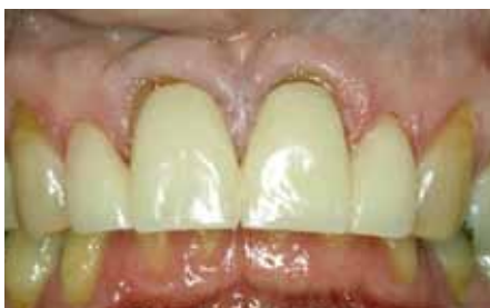
Fig. 7: The provisional bridge also serves as a surgical stent. It shows the location of the gingival margins at the start of the procedure which is useful if these are to be moved.