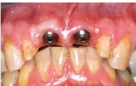
Fig. 16: Trans-gingival gingivaformers were placed through minor access incisions. Implant level impressions were made at the same session.