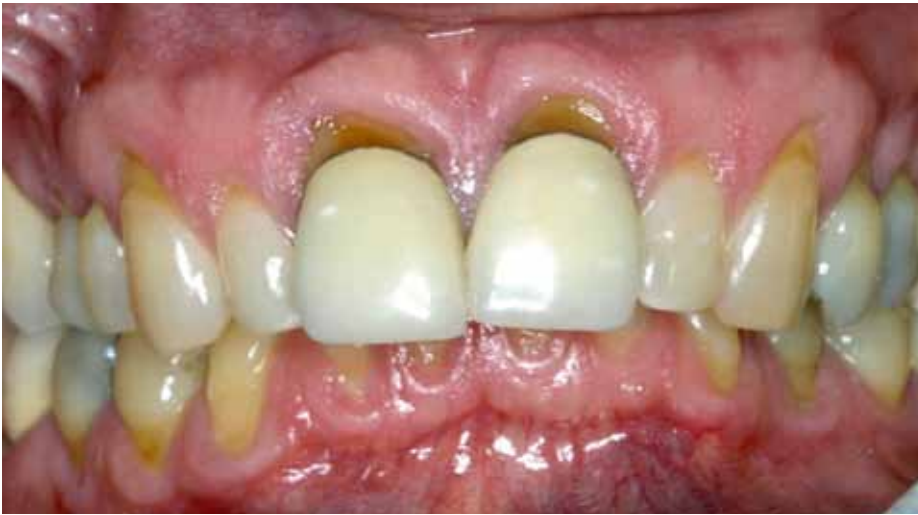
Fig. 23: Many different treatment plans could have been applied to this situation. It was necessary not only to replace the fractured tooth but also to stabilize the supporting structures. In the process it was desirable to enhance the esthetics.