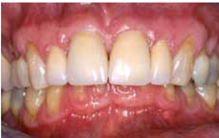
Fig. 21: Final situation 2005.