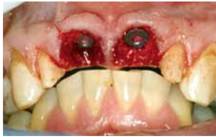
Fig. 10: The channel deficiencies about the implant were filled with Geistlich Bio-Oss® particles.