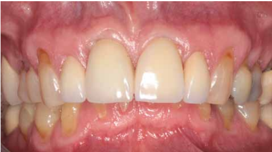
Fig. 25: At the five year recall, it can be seen that the goals of therapy were met and that the final situation is not only stable and functional but also esthetic.