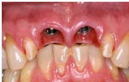
Fig. 17: Screw-retained provisional restorations developed the desired soft tissue "Emergence Profile" and re-established natural form papillae.