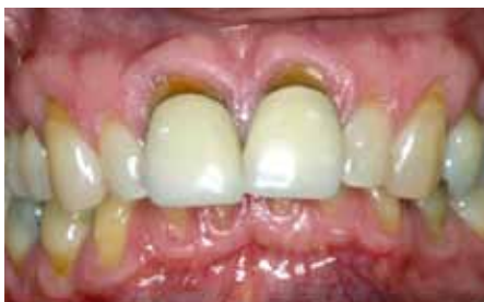
Fig. 1: Original view. The right central incisor is mobile and slightly extruded.