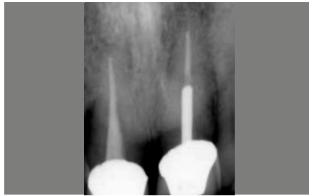
Fig. 20: Starting radiograph.

Here again was the situation at the start of therapy. A crisis situation with the fractured tooth was super-imposed on an unesthetic, deteriorating environment. The need for therapy for the immediate local problem needed to be blended with therapy to stabilize and improve the function and esthetics of the whole region.