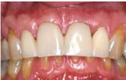
Fig. 14: The provisional restoration functioned well for the healing period of three months.