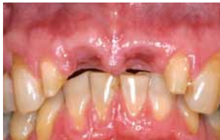
Fig. 15: On removal, the implant platforms were covered with gingiva and peaks of soft tissue remained in the potential embrasure regions.

Emergence profile development is where the soft tissues covering the implant platform are reshaped so they appear as though a tooth is emerging from the gingival complex.