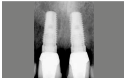
Fig. 22: Final radiograph 2005.

Therapy took nine months. On completion, the esthetics were improved and the situation was healthy and functional. All the way through treatment the patient had a fixed dentition. He was delighted with the result.