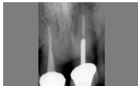
Fig. 3: Initial radiograph. Notice that the adjacent central incisor has endodontic and post therapy.