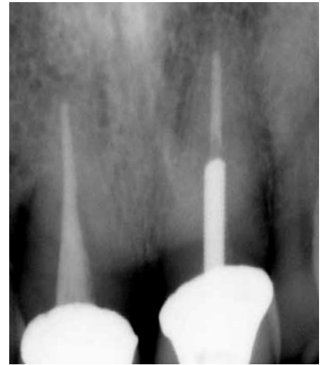
Fig. 24: Starting radiograph.