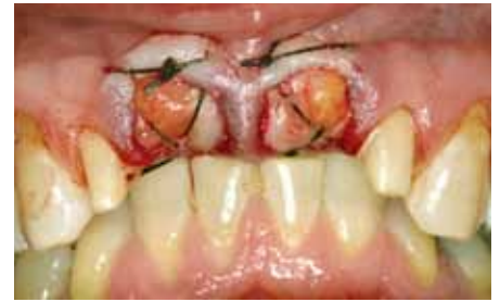
Fig. 11: The marginal gingiva was mobilized and advanced crestally. A connective tissue graft from the palate was placed over the implant platforms and down under the marginal gingiva.