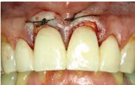
Fig. 12: The previously fabricated provisional was test fitted. The labial margins impinged on the soft tissues, which could be expected to swell in the early post-operative phase.