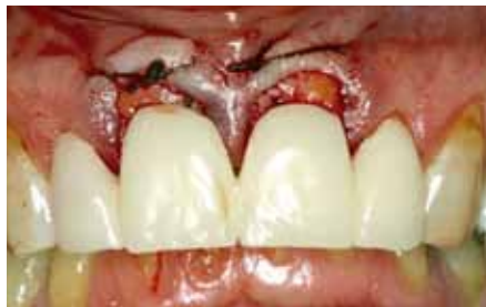
Fig. 13: The labial margins were shortened at the gingival, which improved the esthetics.

While there is much discussion about ensuring correct mesiodistal and buccolingual placement for an implant, the correct vertical position of the implant platform is critical for ensuring adequate soft tissue coverage and developing the optimal emergence profile. In this case, soft tissue augmentation over the implant platforms was critical to achieve the desired result.