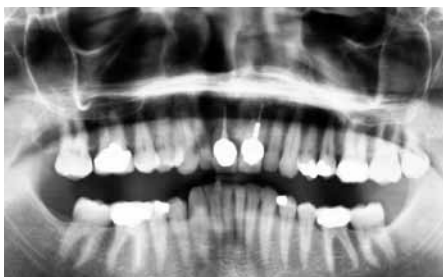
Fig. 4: Panorex showing the intact dentition and generally good supporting structures.