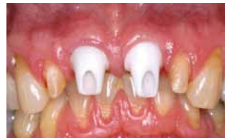
Fig. 18: The ceramic abutment posts maintain the established subgingival form.