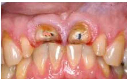
Fig. 6: The two central incisors were sectioned off at gum level and the lateral incisors were prepared for crowns. This ensured a clean operating field while fitting the provisional restoration.