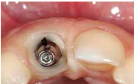
Fig. 24: Individual impression post placed on the implant and the opening of the sulcular structures.