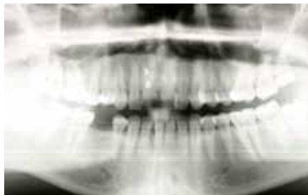
Fig. 2: Radiograph showing endodontic infection of tooth 11.