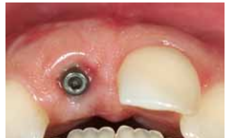
Fig. 14: Four weeks post-op: good soft-tissue healing and gingival adaptation around the bottleneck abutment.