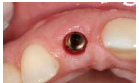
Fig. 17: Nicely healed and healthy soft tissue around a well-integrated implant replacing tooth 11. The absence of scar tissue thanks to the flap design is obvious.