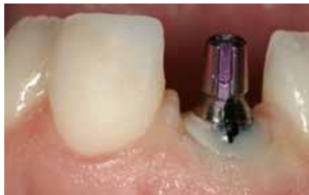
Fig. 25: Lateral view of the implant with impression post.