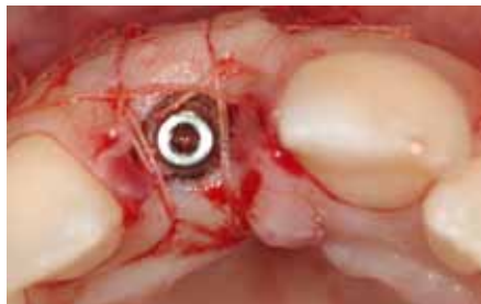
Fig. 13: The bottleneck design of the transmucosal abutment enables a tensionless wound closure.