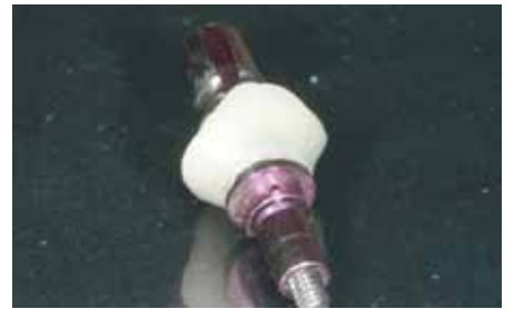
Fig. 23: Individual impression post.