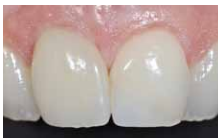
Fig. 31: Stable soft-tissue result showing no resorption at the implant-crown interface or gingival sulcus.