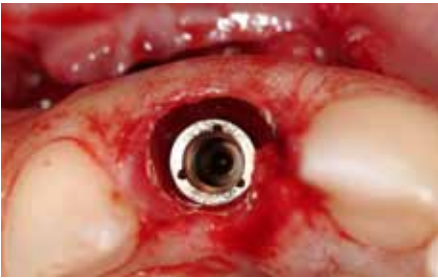
Fig. 9: The implant is inserted with palatinal orientation and a minimum distance of 2 mm to the buccal bone plate in order to prevent its resorption.