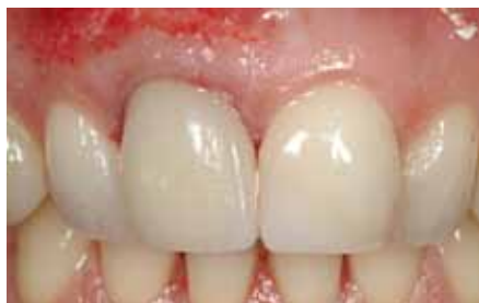
Fig. 28: E-max® crown immediately after definitive placement on individualized ceramic abutment with Panavia® cement. The apical scar tissue was shaped with a diamant drill for a smoother gingival outcome.