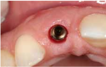
Fig. 21: Clinical situation before impression-taking.