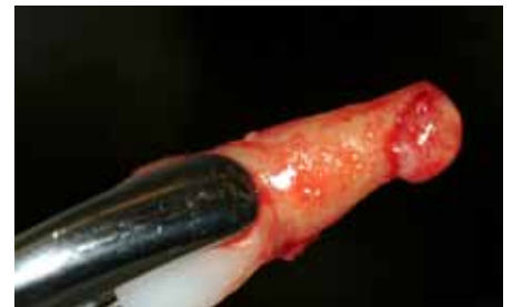
Fig. 3: Careful extraction of tooth 11.