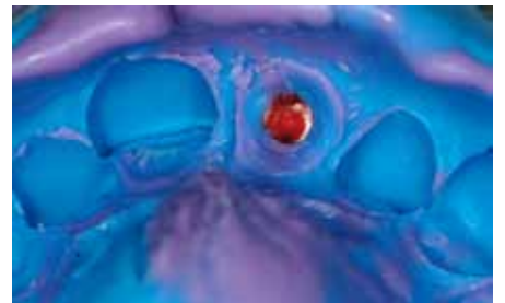
Fig. 26: Impression tray containing the individual information of the crown-gingiva interface.