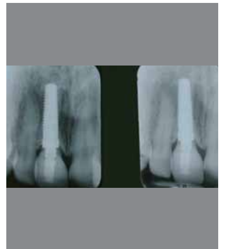
Fig. 35: Final x-ray after one and three years.