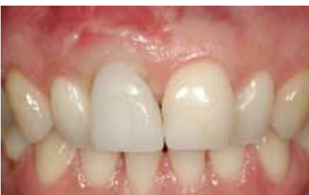
Fig. 18: Placement of a temporary crown with soft-tissue management for a natural looking emergence profile. The submerged part of the occlusal screw-retained crown (concave tulip-like design) supports the subgingival soft tissue.