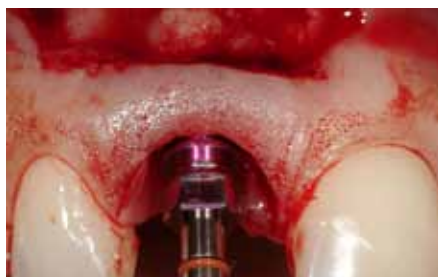
Fig. 8: Three-dimensionally correct 3D placement of a 4.3 mm-diameter implant.

The implant depth is 2 mm below the gingival sulcus and is dependent on the sulcus of tooth 21. To achieve a primary stability of a minimum of 35 Ncm, the final drill was not used to its maximum depth.