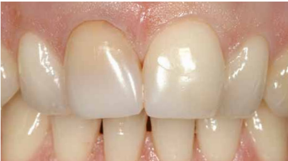
Fig. 32: Initial situation before extraction.