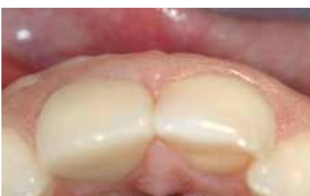
Fig. 30: Optimal tissue contour.