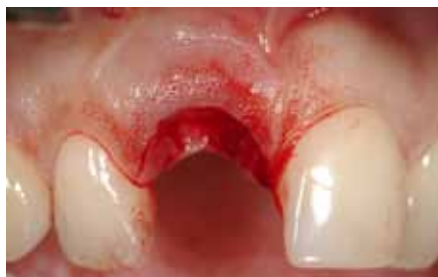
Fig. 5: Intact coronal buccal bone plate. Note the thin interdental papillae. The remaining scar tissue of the former apex resection is clearly visible.