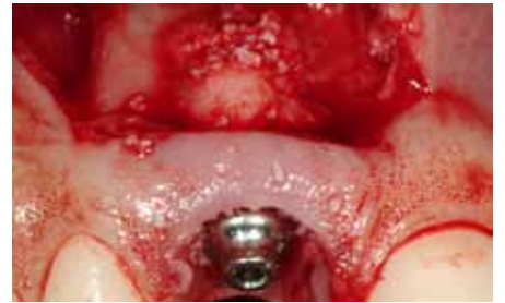
Fig. 11: Additional augmentation of the apical bone plate with grafting material. Use of a membrane is not necessary because of the anatomical shape of the defect.