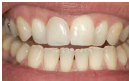
Fig. 16: The removable provisional, used by the patient for the 4-month healing period, shows enough gingival height for a functionally and esthetically acceptable result.