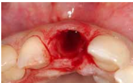
Fig. 4: Good preservation of the marginal hard and soft tissue.