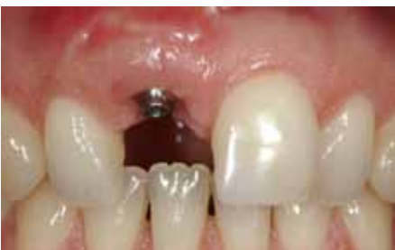
Fig. 15: Stable papillae, nicely preserved soft-tissue volume. The temporary crown is supposed to create the image of a natural sulcus around an implant crown.