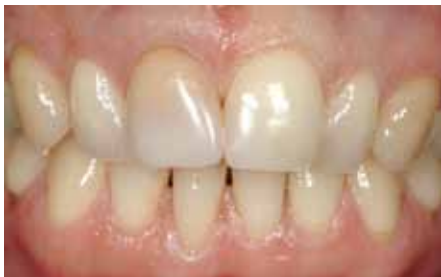
Fig. 1: Patient with high smile line. Incisor 11 discolored and with poor prognosis. Thick gingiva, high scalloped morphology of the interdental papillae.