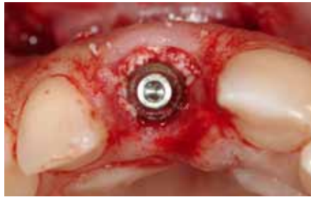
Fig. 10: Augmentation of the remaining spaces between the 4 mm bottleneck healing abutment and the buccal bone plate with Bio-Oss® particles.