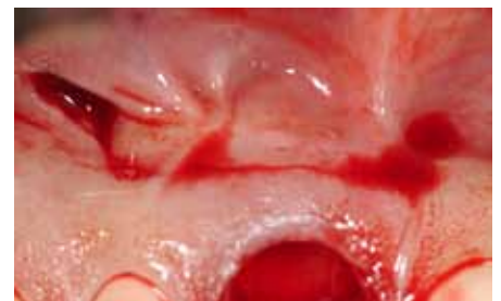
Fig. 6: After a vestibular half-circle incision in the apical part of the keratinized gingiva, a flap is deflected downwards.