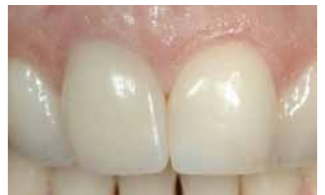
Fig. 29: Final result one year after implant placement. The soft tissue shows a stable and near-perfect interface with the implant crown.