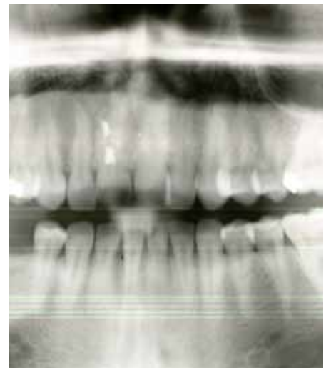
Fig. 33: Initial situation with non preservable tooth 11.