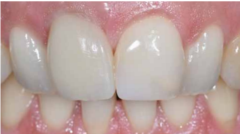
Fig. 34: Clinical situation three years after implantation.