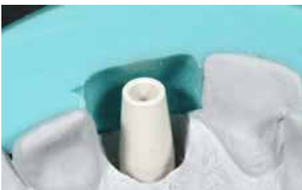
Fig. 27: Master model with temporary abutment and silicon index showing the preservation of the backward planning information.