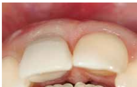
Fig. 19: The screw channel (perforating the labial part of the crown) is covered with a composite inlay. Further apically, the persisting scar tissue can easily be detached from the earlier apex resection.