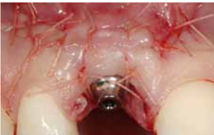
Fig. 12: Primary wound closure with resorbable vicryl sutures 5.0. The apical flap is closed conventionally.