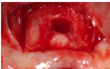
Fig. 7: The apical bone defect becomes visible. Granuloma tissue and endodontic material is accurately removed with the help of a magnifying glass.