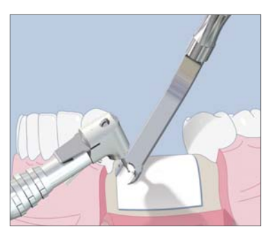
Alternatively, drill the cavity