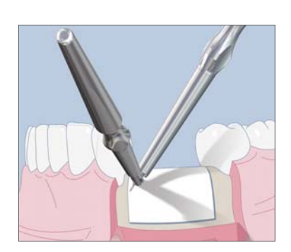
Fix the titanium pin with the blade of the pricker. Afterwards, pull off the applicator sideways.