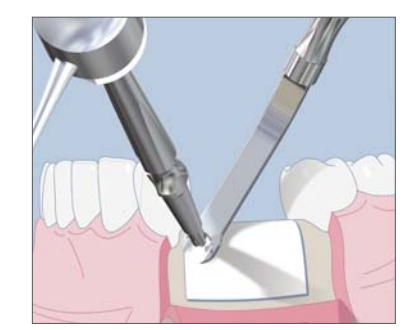
Place the titanium pin with the straight applicator and the surgery mallet.