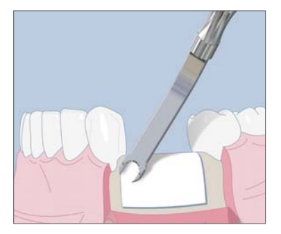
Fix the membrane with the membrane fixator.