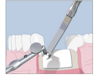
Alternatively, place the titanium pin with the applicator angled 90° with finger rest.