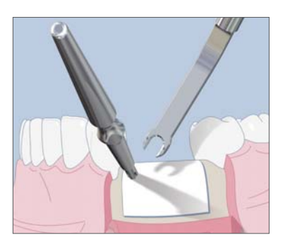
Remove the membrane fixator.