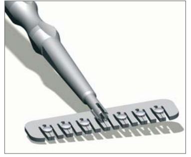
Pick up the titanium pin Set the work element of the applicator on the titanium pin head from vertically above, press slightly so that the titanium pin head gets pressed into the work element.