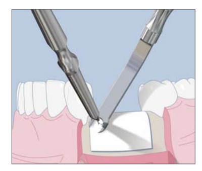
Pre-prick the cavity with the pricker (in soft bone).