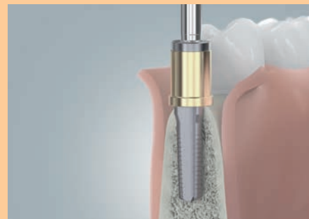
A drill hole for the implant is placed in the bone using special drills.