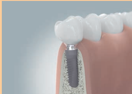
Implant embedded in bone with crown abutment.

Once the implant has been placed, you will be provided with a temporary dental crown if required. In the meantime, your new teeth will be fabricated by the dental technician. Intermediate steps may be necessary to obtain the best functional and esthetic treatment outcome; your practice team will keep you informed about this.