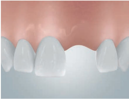
Fig. 1: Single-tooth gap