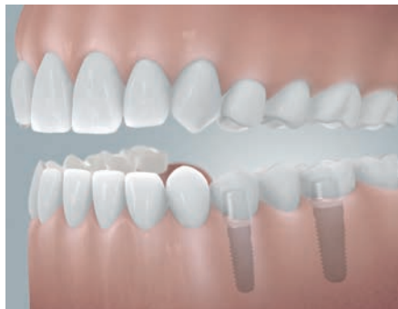
Fig. 2: Bridge on two implants to close the saddle area with three missing teeth