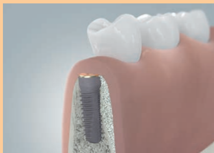
Healing of the inserted implant.