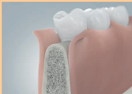
The jaw bone is exposed.

The first stable bone connection is already established at the moment of implantation. It is important to have as much bone surrounding the implant well perfused with blood as possible. During the weeks following implantation, bone growth cells attach to the implant surface from all sides. This process is referred to as osseointegration. Your dentist will explain to you what needs to be observed prior to and after implantation.