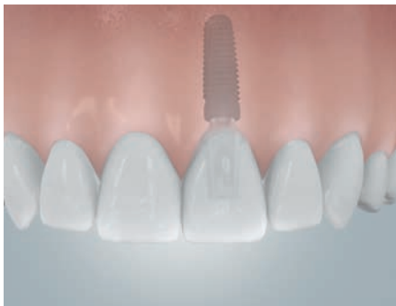
Fig. 1: Implant restoration to replace a central incisor