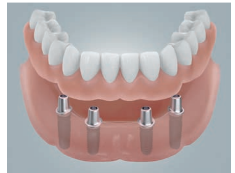
Fig. 3: Fixation on double crowns