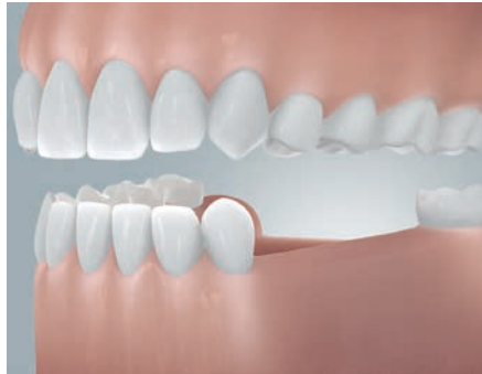
Fig. 2: Larger tooth gap/saddle area