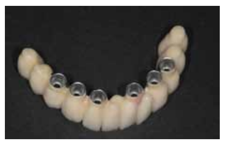
Fig. 28: Basal view of the final screw-retained prosthesis after ceramic veneering.