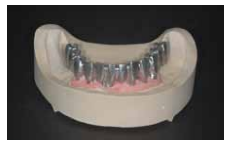
Fig. 25: Scaffold.

The scaffold was modeled with burn-out plastic copings, modeling plastic and wax. To avoid tensions in the modeling, separations and new joining together were made using pattern resin. A special embedding procedure enabled casting to be tension-free. The scaffold was checked on the model and in the mouth using the Sheffield test.