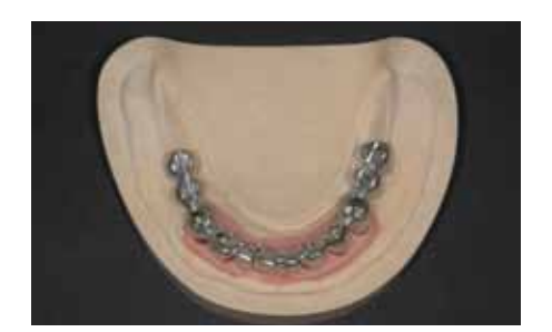
Fig. 24: Scaffold after casting and elaboration.

The scaffold was modeled with burn-out plastic copings, modeling plastic and wax. To avoid tensions in the modeling, separations and new joining together were made using pattern resin. A special embedding procedure enabled casting to be tension-free. The scaffold was checked on the model and in the mouth using the Sheffield test.