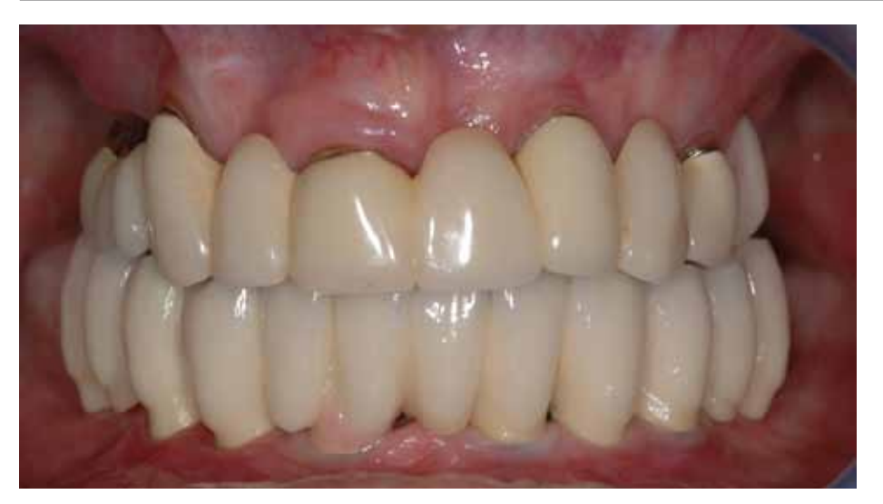
Fig. 35: Intraoral diagnosis after integrating the final restoration.