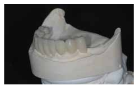
Fig. 5: A wax-up was made preoperatively and transferred to a temporary dish.