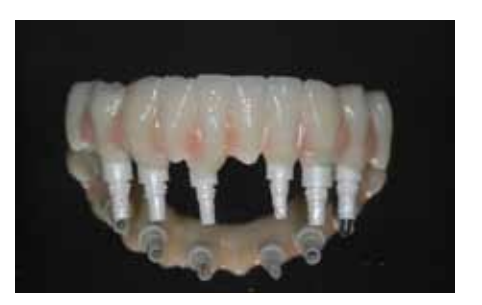
Fig. 14: Long-term temporary denture on PEEK abutments. A key aspect is the restoration's accuracy of fit which was checked clinically using the Sheffield test during insertion.