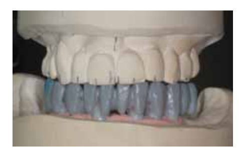
Fig. 21: Scaffold modeling.