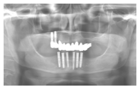
Fig. 8: The postoperative x-ray check shows the proper position of the implants.