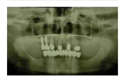
Fig. 4: OPG initial findings; moderate atrophy of the mandible, the remaining teeth in the mandible exhibit horizontal and vertical bone cavities.