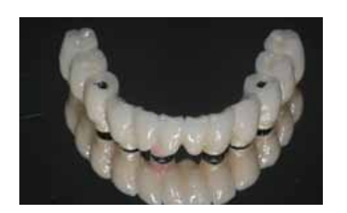
Fig.\ 27:\ Final \, screw-retained \, prosthes is \, after \, ceramic \, veneering.