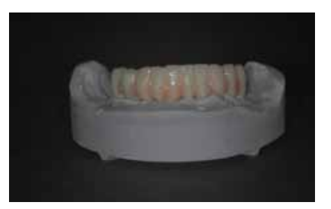
Fig. 13: During preparation of the long-term temporary bridge 35–45, the tooth positions were taken from a wax-up which had been created in advance.