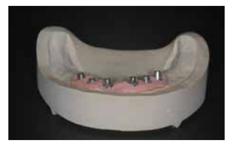
Fig. 20: CAMLOG® Vario SR straight abutments on the model.