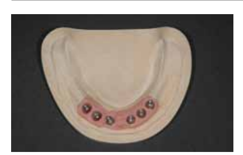
Fig. 19: CAMLOG® Vario SR straight abutments on the model.