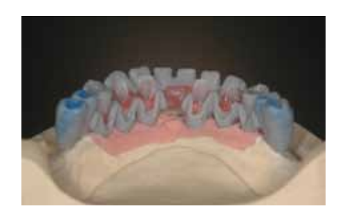
Fig. 22: Scaffold modeling.