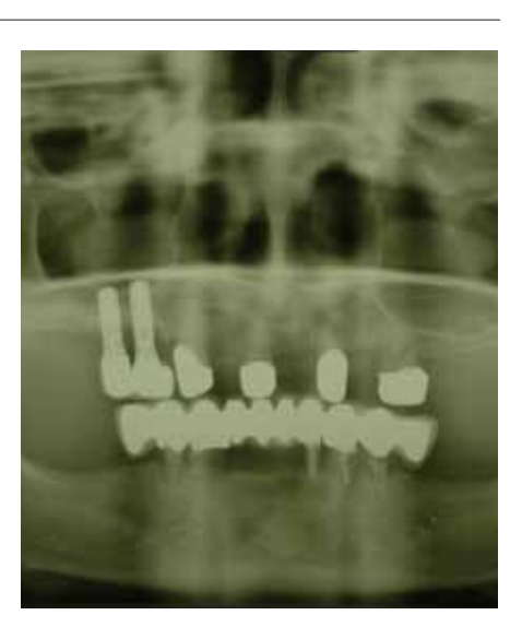
Fig. 34: OPG initial diagnosis.